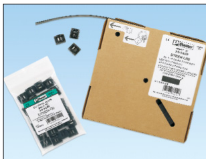
DURA-TY™ Kit – Recyclable dispenser pack has through-hole for attaching to belt plus storage area for bag of heads