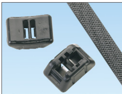
Heavy Cross Section – Textured strap body and robust head design for reliable installations